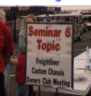
The Place ... The Meeting!!