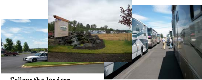
Follow the leaders ...

of the FCOC coaches to Caravan into the FMCA Rally at Redmond OR.