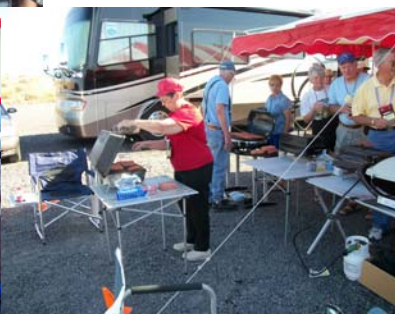
Hey ! Whats under the lid ?