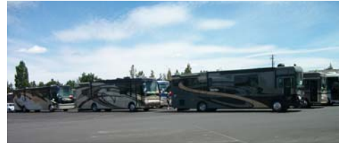
Round them Up !