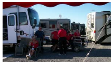
Hanging Out -Team FCCC !