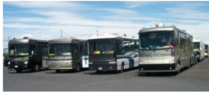
Movem Out !!