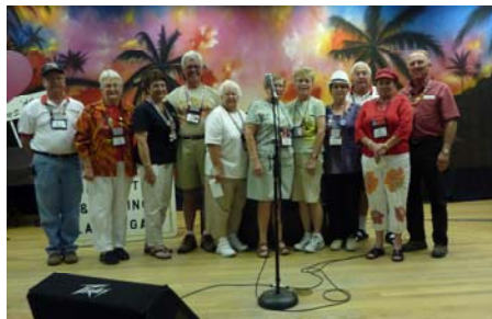
Those that Make a Rally GO!