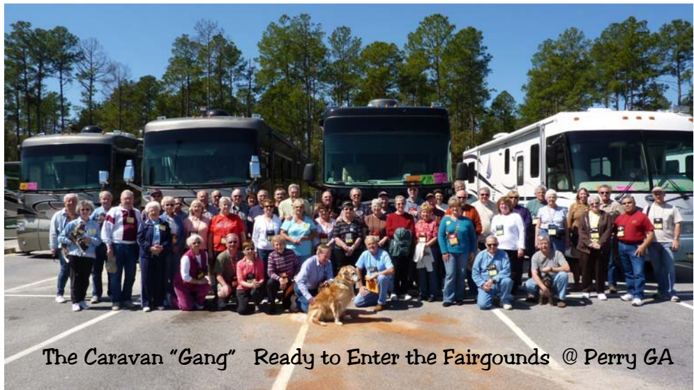
The Caravan "Gang" Ready to Enter the Fairgrounds @ Perry GA