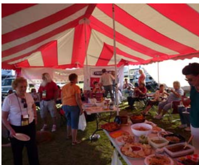
The most Hospitable Place @ the Rally