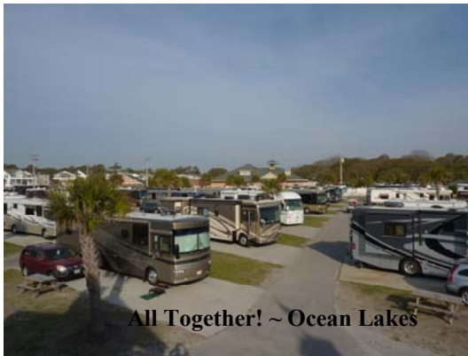
All Together! ~ Ocean Lakes