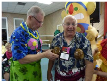
O.K. Let's see the Hula!