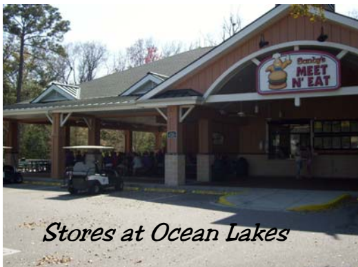
Stores at Ocean Lakes