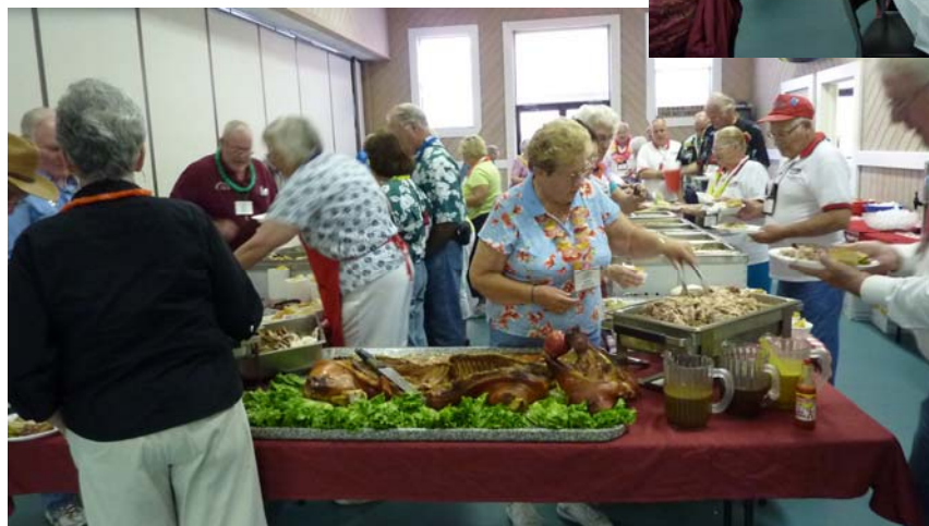
YUM !! Love an Laua !