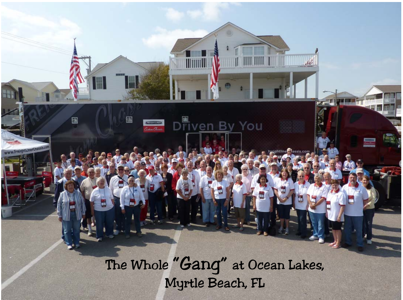
The Whole "Gang" at Ocean Lakes, Myrtle Beach, FL