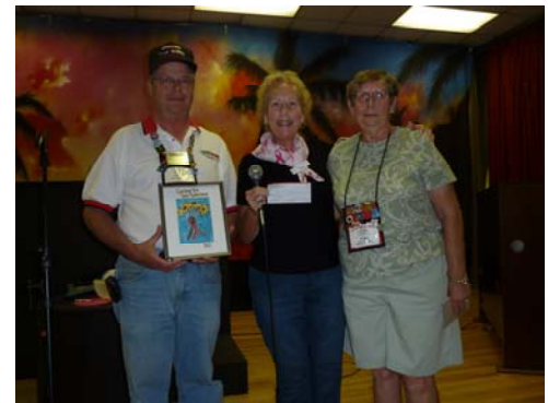
Special Gift from FCOC to Charity Caring In Our Lifetime !