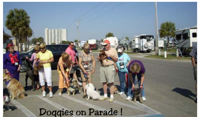
Doggies on Parade !