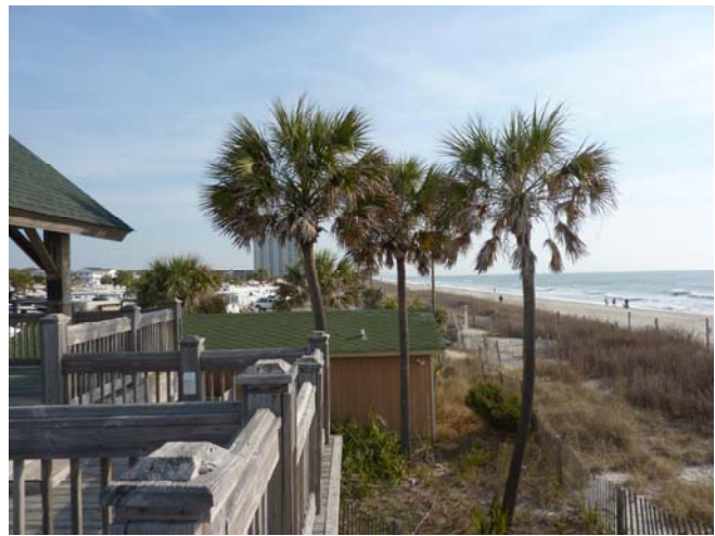
Ocean & Palms go together!