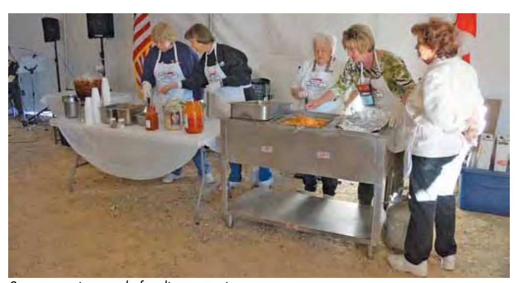
Servers getting ready for dinner service