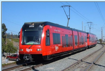
San Diego Trolley