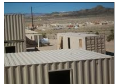
Above, hearing about their Recycling Center, and Bottom, Mock Training village