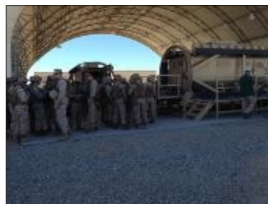
Above, checking out the military vehicles, below, Marines in training,