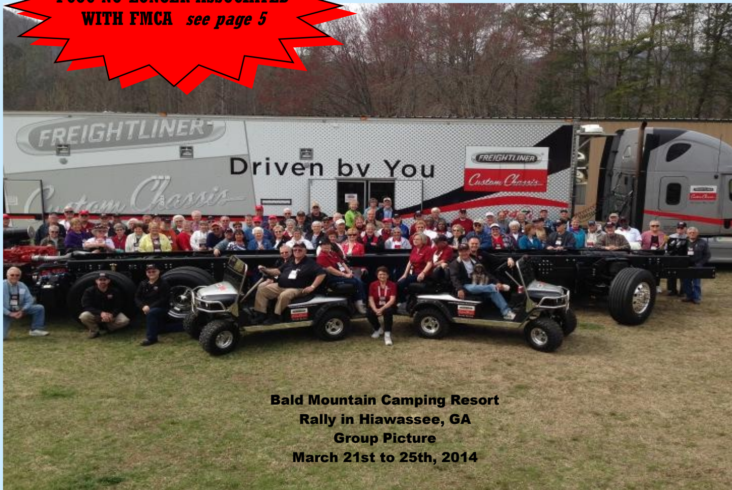
Bald Mountain Camping Resort Rally in Hiawassee, GA Group Picture March 21st to 25th, 2014

FCOC NO LONGER ASSOCIATED WITH FMCA see page 5