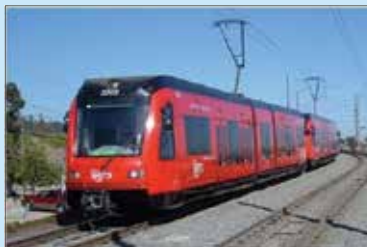
San Diego Trolley