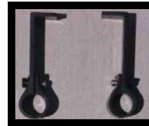
Logo Plaque Holder