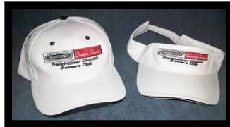
Logo Hat and Visor