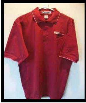
Mens Style Shirt