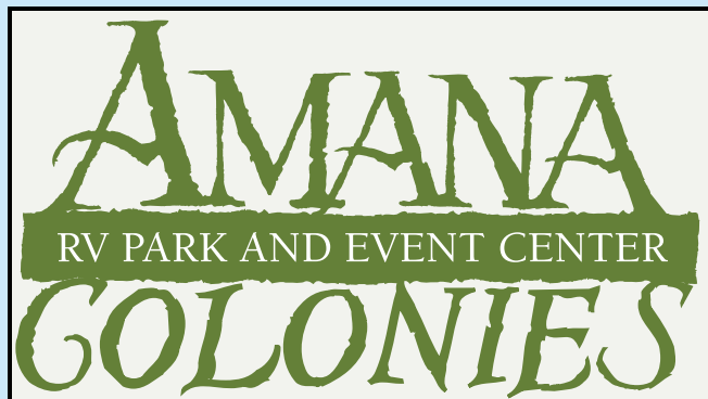
AMANA COLONIES RV PARK SUMMER RALLY AMANA, IA, JULY 20—24, 2015