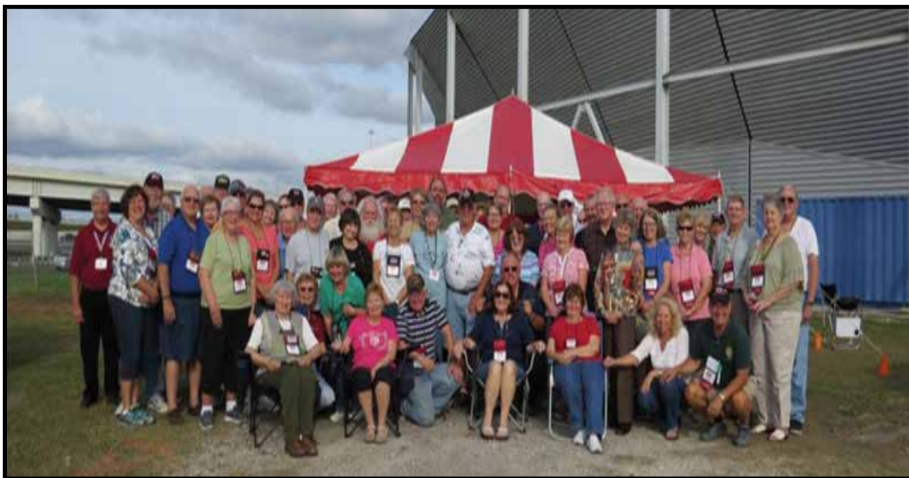
This group picture was taken right after registration.

The FCOC Southeast Area Rally had 41 coaches in attendance making it our largest Southeast Area rally to date. Some were not from the Southeast area but were spending the winter in Florida. Every afternoon there was a Meet and Greet with lots of good fellowship, a delicious potluck dinner the first evening, and coffee and donuts at the Freightliner tent the following morning sponsored by the FCOC Club.