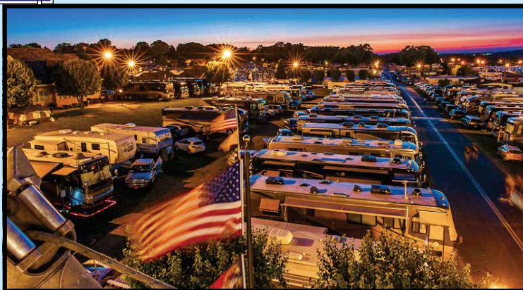
Concord, North Carolina Rally Ver-El Mobile Village October 19—23, 2015