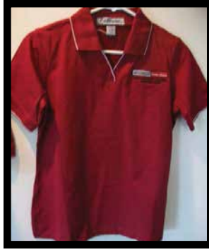
Womens Style Shirt