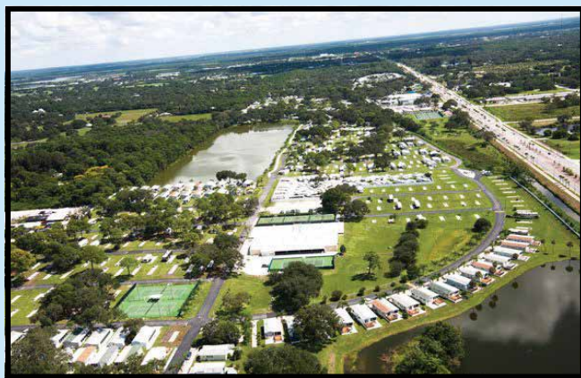
SPRING IN SARASOTA, SUN AND FUN RESORT, SARASOTA, FL APRIL 20 TO 24, 2015

New Features Enclosed Check out Available Dates For Camp Freightliner (As of this writing), page 12 And a New Feature Getting to Know FCCC Forum Page 13 Transwest RV Open House Frederick, CO Page 9