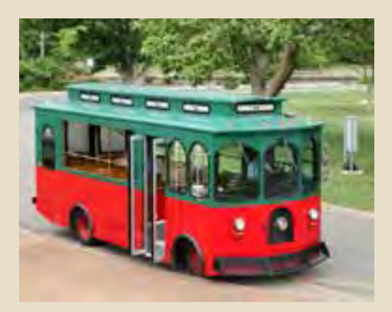
ENJOY A TROLLEY TOUR AROUND BOSTON WHILE ATTENDING THE 2016 NATIONAL FCOC RALLY

72 WEST STREET, FOXBORO, MA 866-673-2767 • NORMANDYFARMS.COM